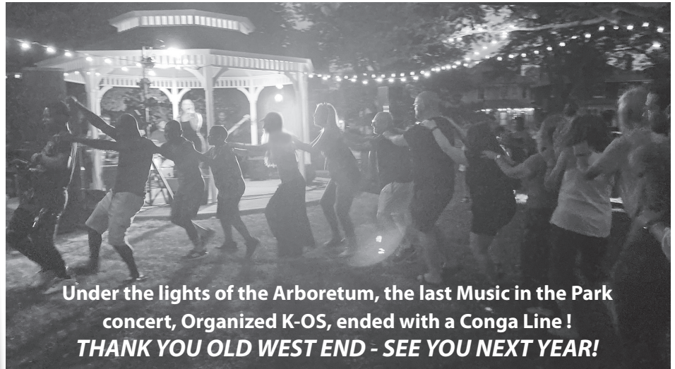
Under the lights of the Arboretum, the last Music in the Park concert, Organized K-OS, ended with a Conga Line! THANK YOU OLD WEST END - SEE YOU NEXT YEAR!