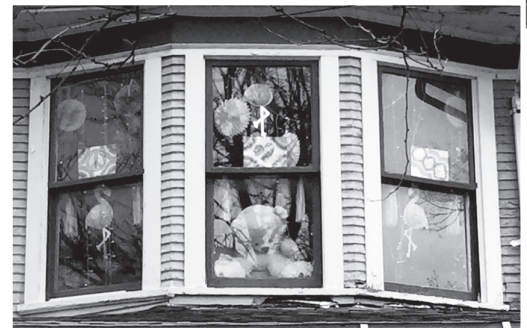
Stuffed Animal Window Safari Displays (Baldwin, Scottwood and Robinwood)

Senior Meals Availability: Contact Area Office on Aging (800) 472-7277)