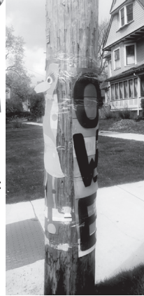
OWE, Mr. Pickle, Flamingo, Smile Emojis