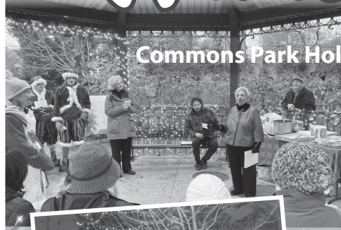
Commons Park Holiday Tree Lighting