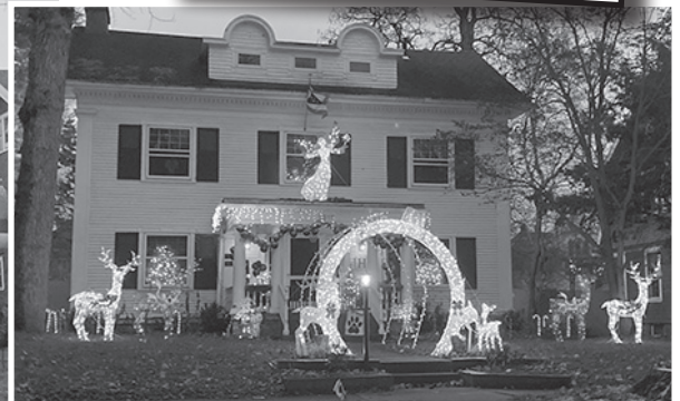
2500 block of Glenwood