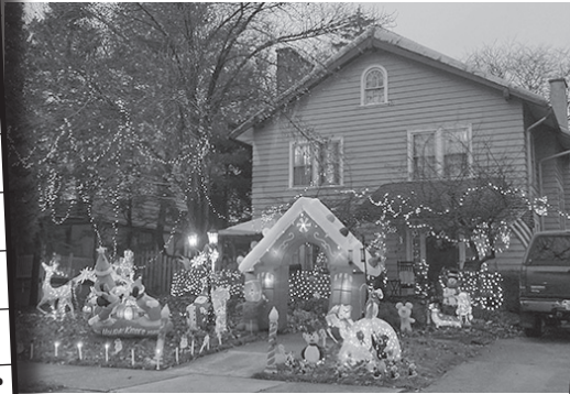
2400 block of Scottwood

OWE Houses all dressed up for the Holidays!