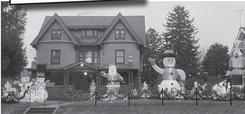
2500 block of Scottwood

for endless hours of volunteering for the many areas of need in the Old West End. This is what we do as a community and why this is the BEST NEIGHBORHOOD in Toledo!