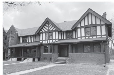
Glenwood Terrace 2482 Glenwood Ave.