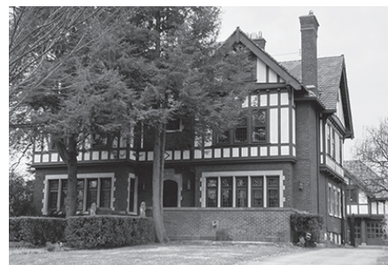
Coldham - Storer - Wilcox House 2243 Robinwood Ave.