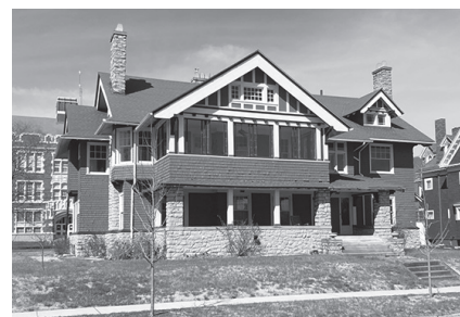
Wolcott - Huston House 424 Winthrop St.