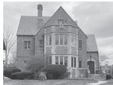
Huttinger - McCreary House 2561 Parkwood & 615 Islington St.