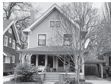
The Ansted/Myers - Freshour/Ashley House 622 Islington St.