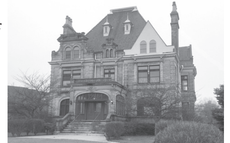
R.A. Bartley - Museum Place 1855 Collingwood Blvd.