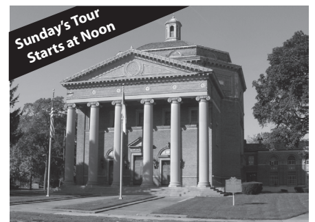
First Congregational Church 2315 Collingwood Blvd.