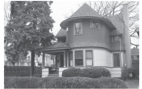
The Chesborough - Kramer Home 634 Acklin Ave.