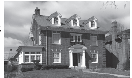
The Anderson - Kraft Home 2125 Robinwood Ave.